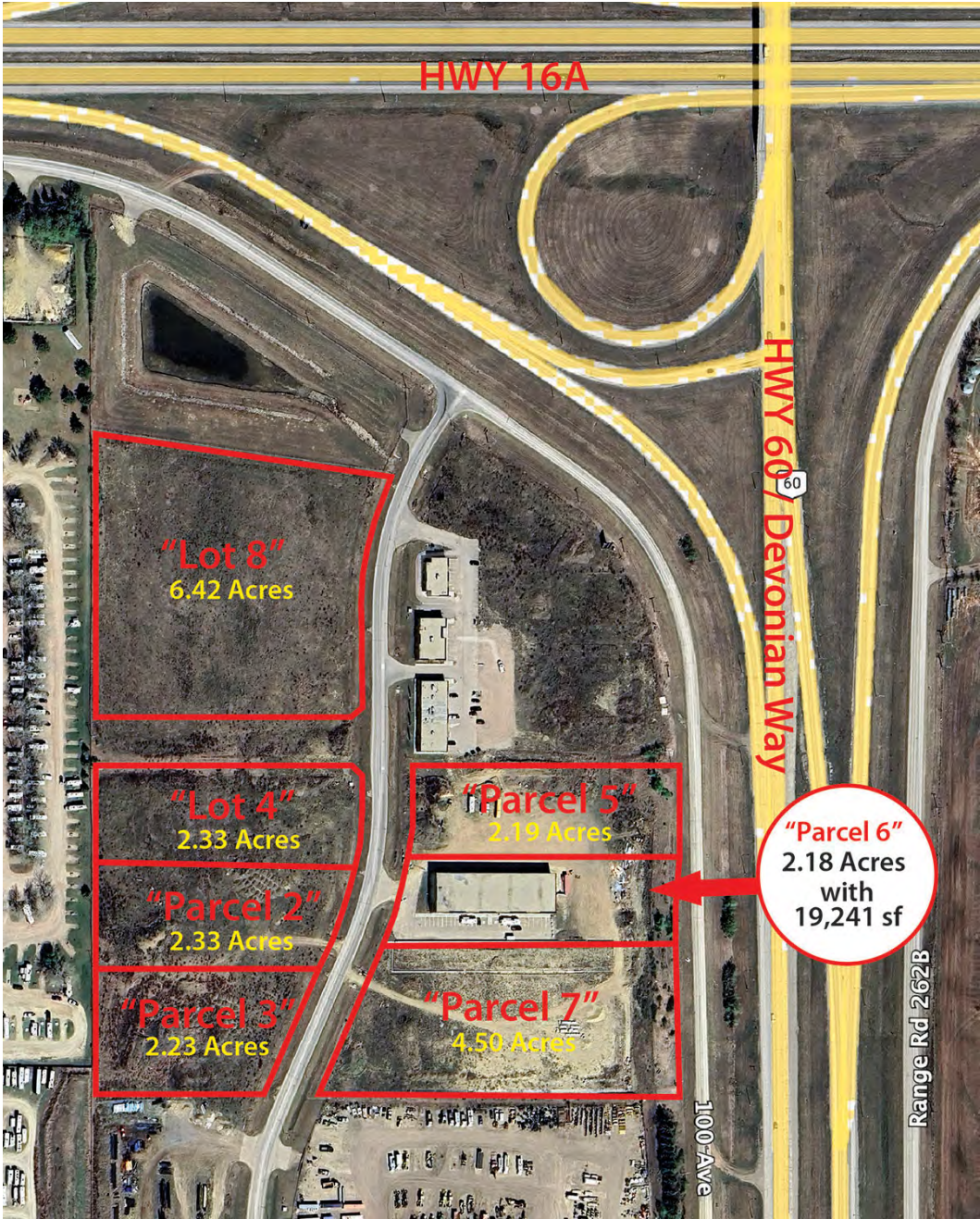
Highway 16A and Highway 60