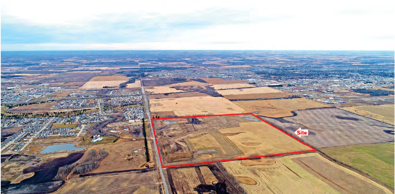
157.04 Acres - Stony Plain